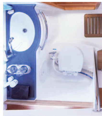
Two large heads with easy-care surfaces, rich mahogany and teak accents and showers