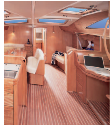
Open interior layout with eight fixed hull ports, two deck skylights, nine opening hatches with roller shades and two non-opening panoramic windows for enhanced light and cross-ventilation

At 51.5 feet overall, the Bavaria 50vision contains too much comfort to fit in a 50 footer - a large owner's stateroom forward, two spacious guest staterooms aft, separate shower stall, U-shaped galley, full dinette and casual seating with cocktail table in the main salon.