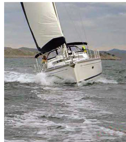
Kevlar-reinforced bow sections, wide side decks and an easily managed sail plan