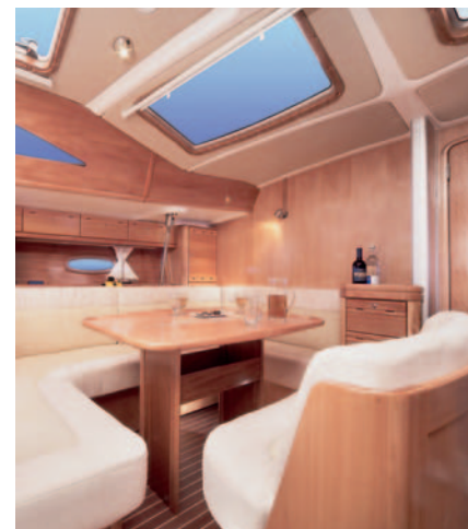
Rich, new lighter-colored mahogany interior finish featuring wide, solid wood cabin doors and dinette table