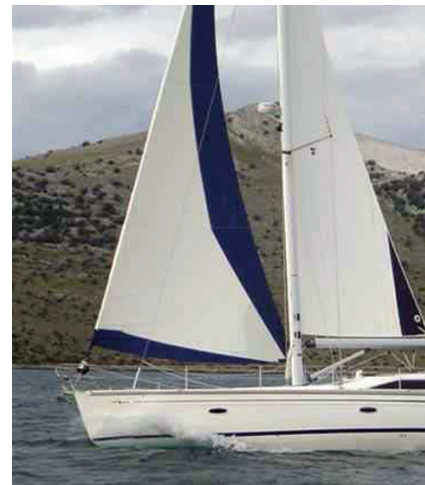
Double spreader Selden mast, conventional, furling or fully-battened mainsail, adjustable pneumatic boom vang and adjustable backstay