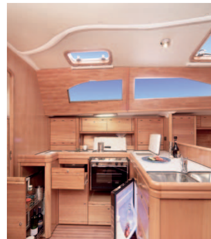
Spacious I-shaped galley, enclosed locker storage, front-opening refrigerator and propane stove with oven