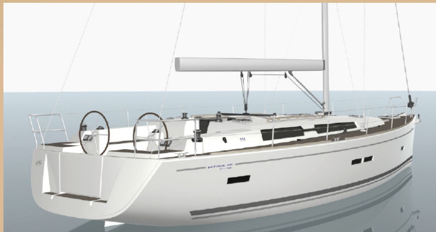
DUFOUR | 445 Grand'Large

- Standard Description - DUF0UR 445 Grand'Large - September 2011 -